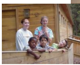
Learning to go from mad to glad!