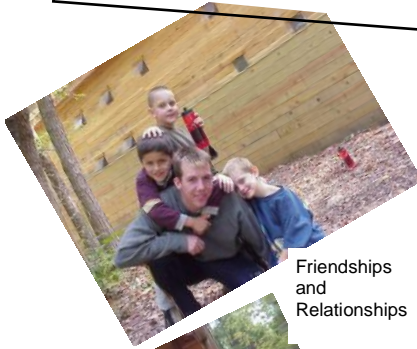
Friendships and Relationships