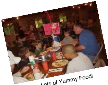
Lots of Yummy Food!