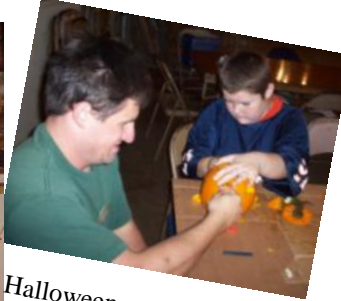
Halloween- getting the gunk out