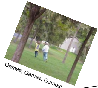
Games, Games, Games!