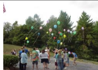
Releasing hurts; concerns to God. New Beginnings!