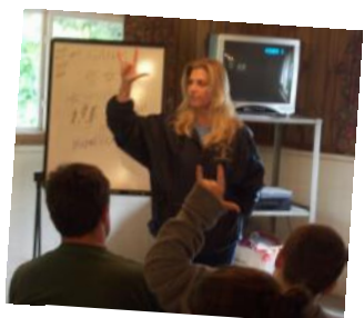
Belonging to God The I Love You Sign!