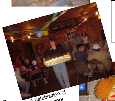
A celebration of Everyone!

Send Your Child to Camp It Makes a Difference!