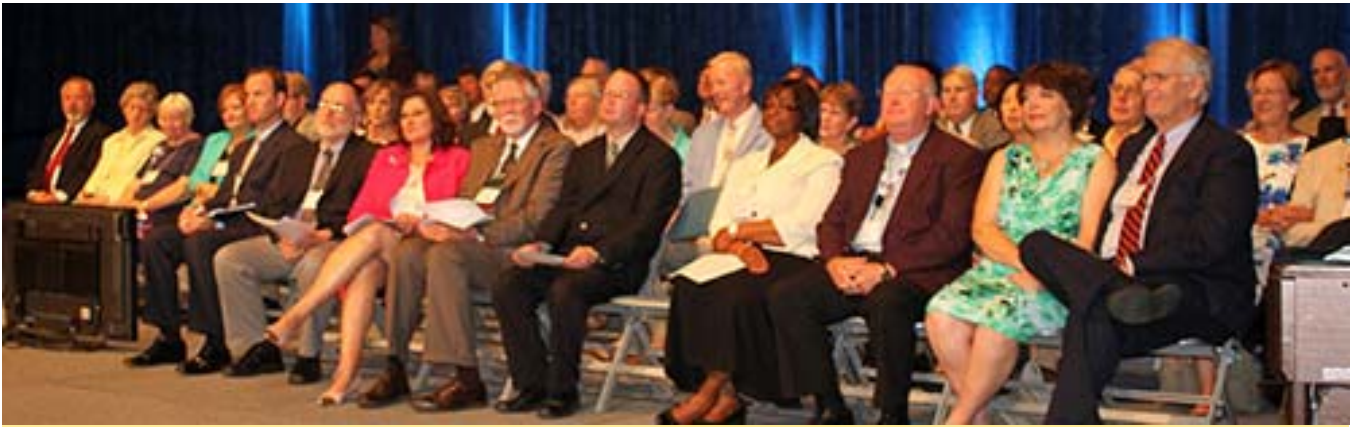
2014 Class of Retirees