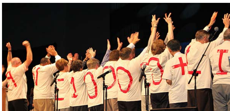
The Cabinet spells out 'Save 100,000+ Lives.