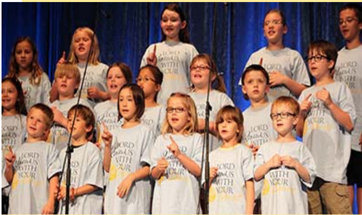
Children's Choir from First UMC, Fox Hill, and First UMC, Hampton sing 'This Little Light of Mine'.