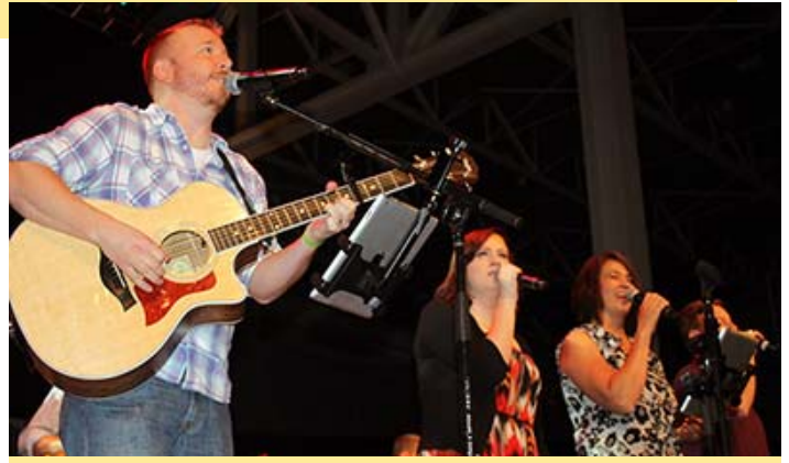
Annual Conference music leaders, Ebenezer Worship Team.