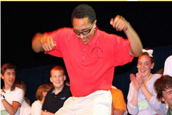
Happy dancing with the Bishop.