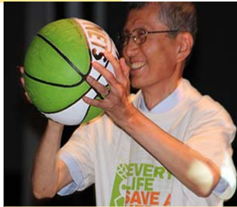
Bishop Cho dances the 'Happy Dance' to 'Imagine No Malaria'.