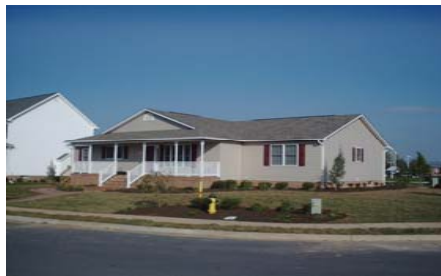
The finished home located at: 3050 Saratoga Drive in Winchester